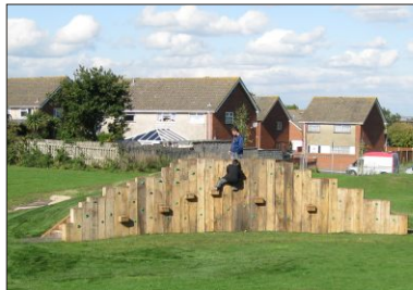
Play: Willmott Park oak climbing wall, Bristol