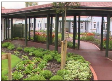
Elderly Care: Sandford Dementia Garden, Somerset