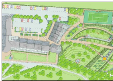
Leisure: Gara Rock Hotel, South Devon