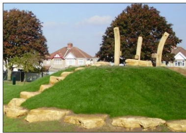
Public Parks: Gores Marsh Park natural play area, Bristol