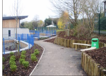
Gillingstool & Siblands Primary School