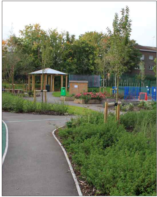
Cycle/wheel play route - New Siblands gardens